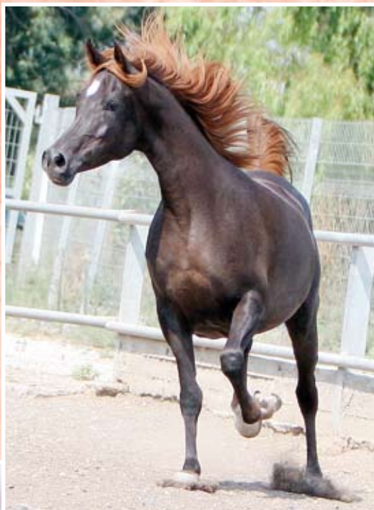
The 2000 mare Hora B (Halim Shah I x 216 Haszuna B out of 227 Ibn Galal I), imported to Israel as a weanling.