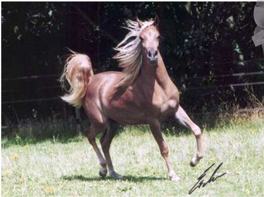
Simeon Sarice, an Imperial Madaar daughter out of Simeon Sayver (Anaza Bay Shahh x Simeon Sukari).