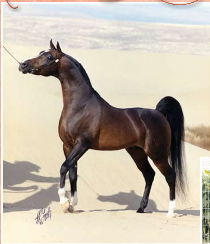
The unforgettable 1984 stallion Simeon Shai (Raadin Royal Star x Simeon Safanad).