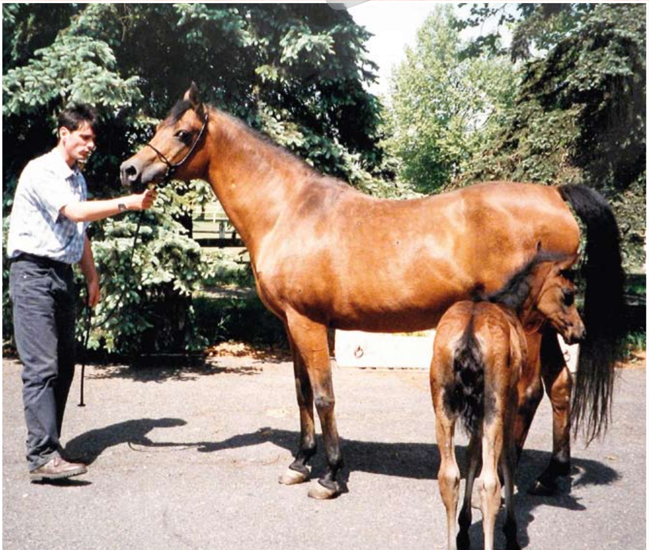
The very exotic 18-year old mare 227 Ibn Galal I (Ibn Galal I x 202 Ibn Galal), at Babolna in June 2000. Tragically, she grew ill and died prior to export; we received her black daughter 247 Rajan B as a replacement.