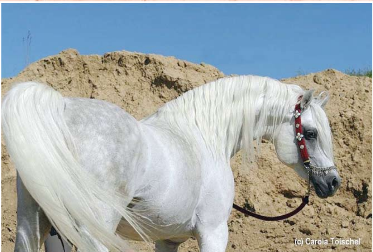
The stallion Ibn Halim Shah I-1 by Orashan out of Halim Shah I-1 (Halim Shah I x 227 Ibn Galal) as a young horse in Germany.