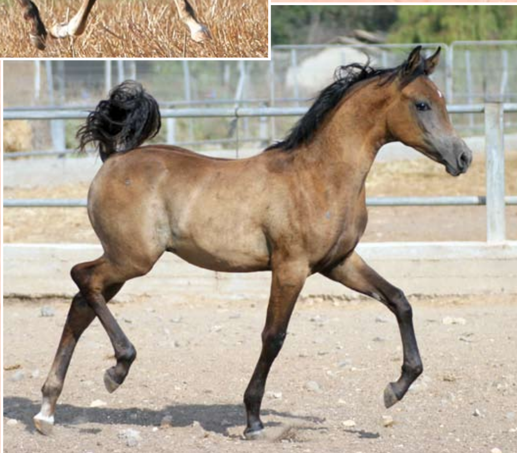
The 2006 stallion Atiq Hilal (Laheeb x Hila B), now a herd sire at Idan Atiq. © Menashe Cohen