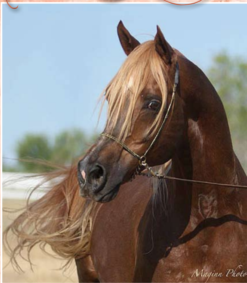
The proven halter and performance sire Simeon Sochain (Simeon Sadik x Simeon Simona) was recently exported to North America.

breeder will tell you, theoretical potential does not always result in predictable results. Fortunately, in this case, this breeding combination struck pure gold; over several decades it has consistently produced extremely balanced and athletic Arabians with wonderful type and expression, particularly beautiful eyes, great depth and substance, sound limbs and feet, full pigmentation (including particularly vibrant chestnut hues), excellent movement, faultless tail carriage, and ideal temperament.