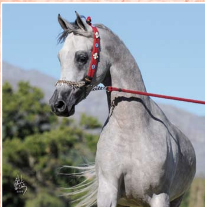
The young stallion Atiq Haleeb (Laheeb x Hila B), exported to Namibia.