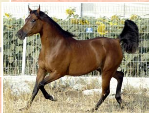
The 2000 mare Hila B (Efendi B x Haniya B out of 227 Ibn Galal I) chosen as a weanling at Babolna for Idan Atiq.

straight Egyptian mare, sired by former Babolna Chief Sire, Ibn Galal I, a son of the celebrated mare Hanan (Alaa el Din x Mona). Her dam was 202 Ibn Galal, which meant that she was a direct maternal granddaughter of the original Egyptian import, Hosna.