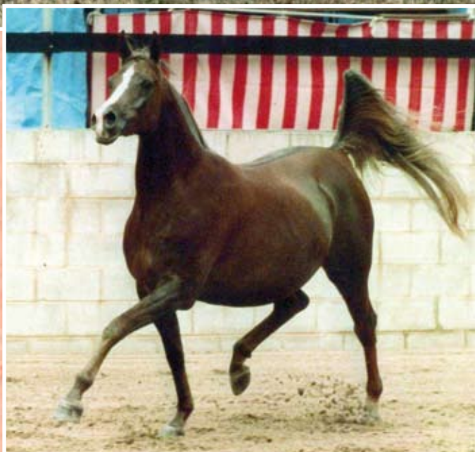
27 Ibn Galal-5, or 'Galal', imported foundation mare for Simeon Stud, demonstrates the flagged tail carriage and powerful fluid movement for which the Hosna family is justly famous.

Turning back to the mare, my eyes chanced upon the sign hanging high above the stall, which quickly solved the riddle of her identity. According to the sign, this was 227 Ibn Galal I, an 18-year old