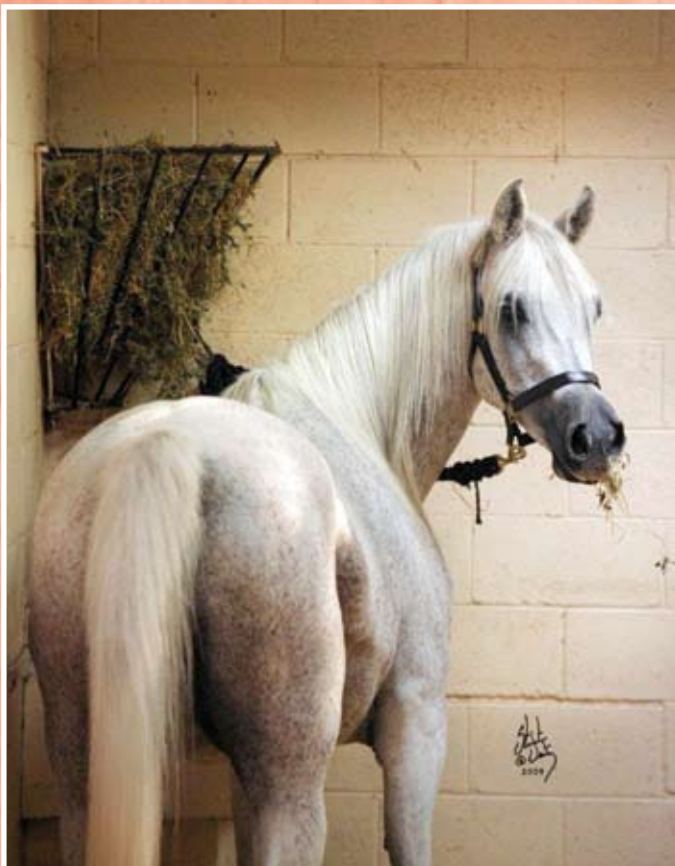
Simeon Saada, an Asfour daughter out of Simeon Safanad (Sankt Georg x 27 Ibn Galal - 5).

Mohga (El Sareei x Yosreia), known for her particularly beautiful head. Mohga was the dam of the well-known US Reserve National Champion Mare Nahlah (ex Morafic) and the famous black stallion El Mokhtar (ex Galal), star of the film "The Black Stallion Returns".