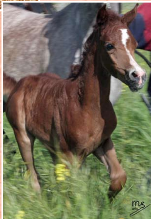
The 2007 filly Atiq Hadas (MD Elsuperado x Hopa B).