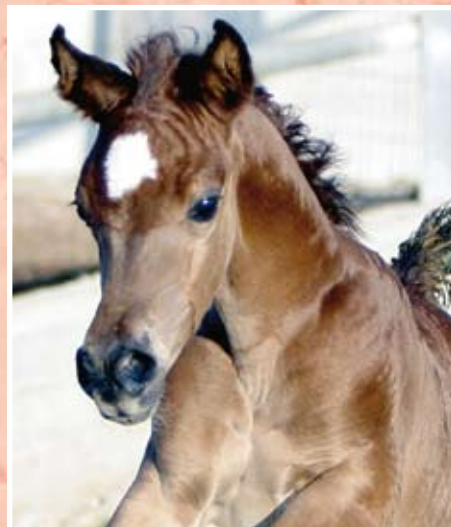
The 2007 filly Atiq Haliah (MD Elesperado x Hila B) at one week old.