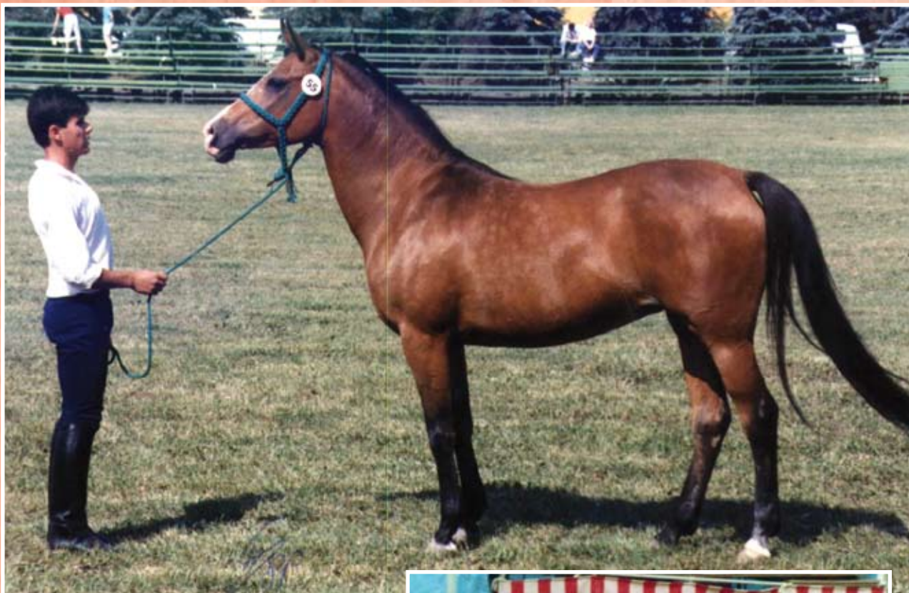
202 Ibn Galal spent her entire life in Hungary and was the SE daughter who carried Hosna's family forward at Babolna. When we saw her at age 24 she was still in excellent shape and was a tremendous mover with exceptional tail carriage. Pictured here as younger mare.

with the blood vessels showing clearly beneath fine dark skin. Her wide forehead and deep jowls tapered down to a chiseled muzzle with generous and expansive nostrils. An elegantly arched neck and matching high set tail accented her harmonious, deep body to perfection. A young bay colt nursed at her side.