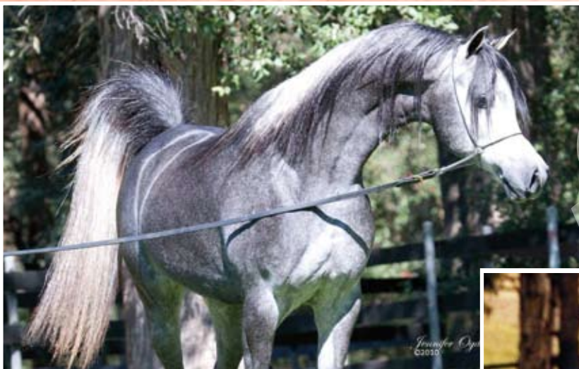
The young herd sire Simeon Shifran (Asfour x Simeon Shavit).