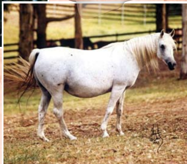
The classic Simeon foundation mare, Simeon Safanad (Sankt Georg x 27 Ibn Galal - 5).