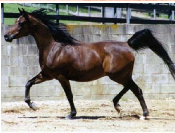
The beautiful bay mare Simeon Sahron (Anaza Bay Shahh x Simeon Shavit).