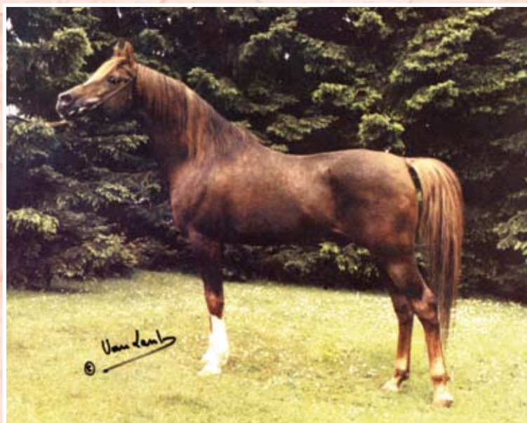
The 1966 stallion Ibn Galal or 'Magdi' (Galal x Mohga), bred by the EAO and Chief Sire at Babolna during the '70's, was an excellent sire and proved the perfect mate for Hosna.